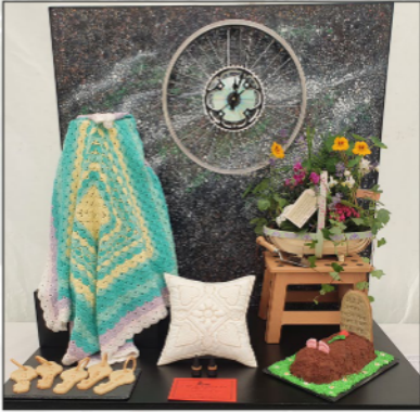
W.I. Handicraft & Horticulture