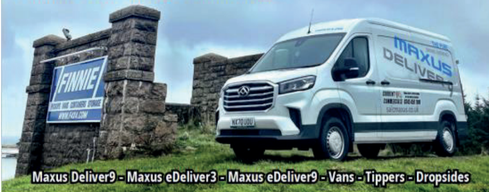
Maxus Deliver9 - Maxus eDeliver3 - Maxus eDeliver9 - Vans - Tippers - Dropsides

With top specs and quick delivery it's time to make the move to Maxus with Current Commercials!