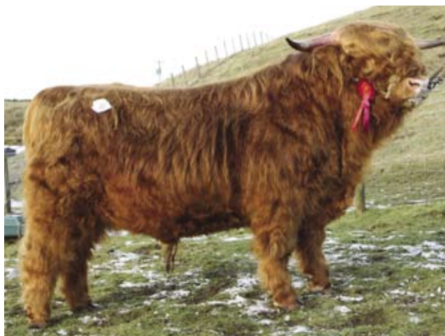
Achadh Chuilter of Ormsary