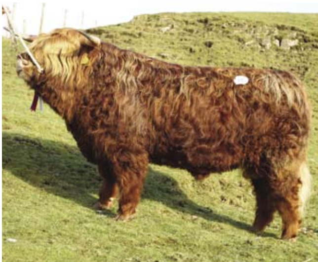
Gaisgeachist of Culfoich