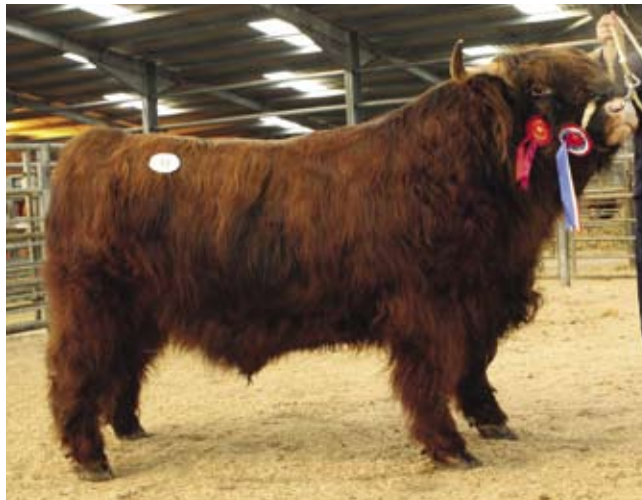
Fergus Ruadh 2 of Knockendon

WITH OVERSEAS buyers purchasing a third of the entry and willing to pay top dollar, including the day's best price of 14,000gns, Highland breeders left Oban on a high on Monday evening.