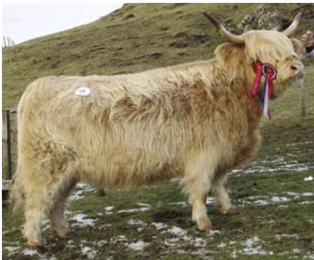
Bhan Og 15 of Ormsary